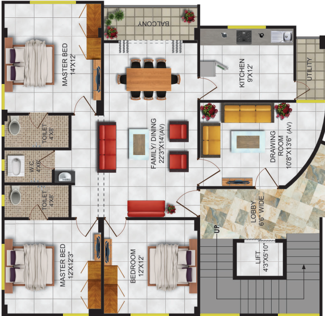
FLAT- 103, 203, 303, 403, 503 (1275 Sq.Ft.)